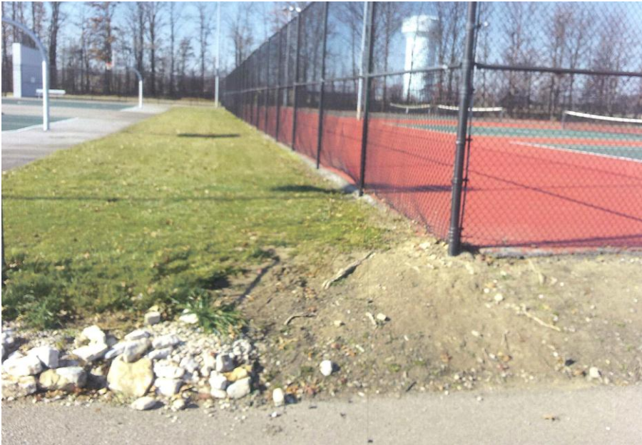
BEFORE Ball Court Impervious Surface Runoff