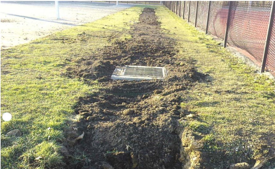
DURING Infiltration Trench