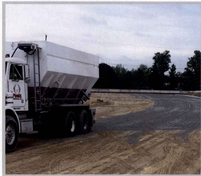
Construction of recently-completed Home Road extension west of US 23